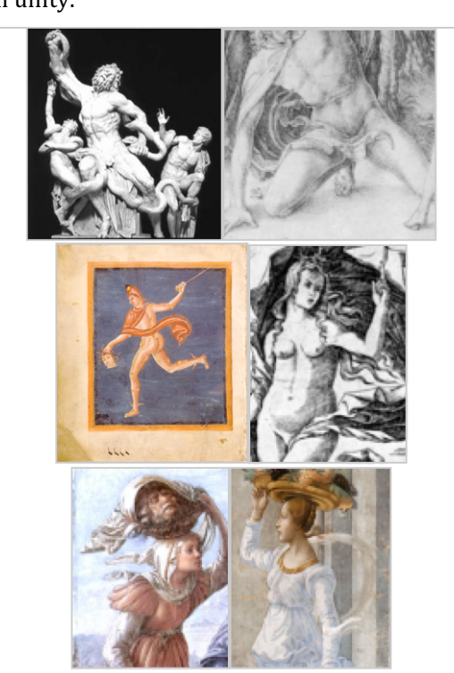
Figure 4, clockwise from top-left: Laocoön, Orpheus, Fortuna, Nymph, Judith, Perseus - all except Orpheus are in the Atlas. The identified Pathosformeln share distinguishing features from the other characters in the Atlas: a raised arm, most often accompanied by a lowered second arm, and a slight twist of the body.

Looking more closely at the images themselves, as in Figure 4, this becomes visually clear: not only do the Pathosformeln share certain pose features (most importantly, a raised arm) present nowhere else in the dataset. To date, however, the authors know of no arthistorical literature that has identified such morphological unity.