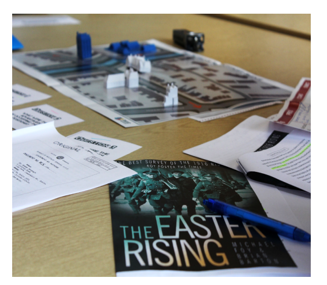
Figure 2. Physical Materials used in 'Lesson 1 - Group 1: The Buildings

In terms of app design, the project team were aware of the challenge of how technologies have shifted our attention from the physical to the digital space: interactions with devices absorb attention, distracting from physical experiences and social interaction (Chrysanthi et al., 2012). Therefore, a premise of the project is that, if digital technologies are to assume an active role in history teaching and learning, ways to actively engage students by creating conditions that blend the physical and the digital through participatory and hands-on engagements need to be employed (figure 2).