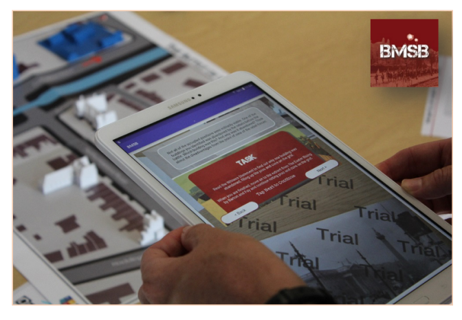
Figure 1. Early prototype of the BMSB Augmented Reality app

These kinds of technologically-driven blendedlearning applications which improve digital literacy are seen as the key to the future of education, not only in Ireland, but abroad (see the Digital Strategy for Irish Schools, 2015-2020). Their employment might help to solve challenges such as personalised learning, keeping education relevant, and blending formal and informal processes (Johnson et al., 2016). This project also resonates with the call for a change in history instruction; from one that promotes passive consumption of facts to that which makes more use of analogue and digital primary sources to foster historical thinking (Tally and Goldenberg, 2005; Lee et al., 2006; Stripling, 2011), teaches historical reasoning (van Drie and van Boxtel, 2007), and provides the opportunity to problematise different sources, evaluate arguments, and form new interpretations (Borton and Levstik, 2004).