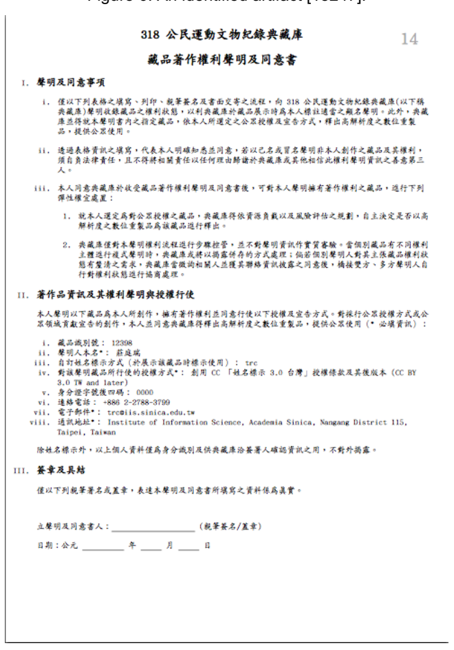
Figure 7A. A copyright declaration and release form.