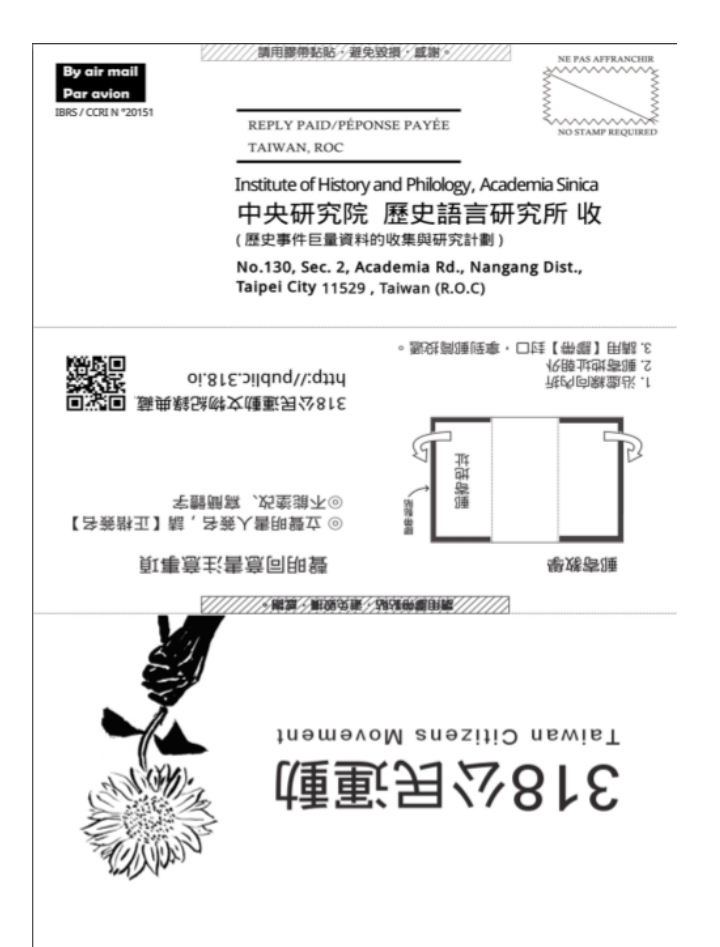
Figure 7B. The back cover of the form, to be folded into an envelope — NO STAMP REQUIRED.