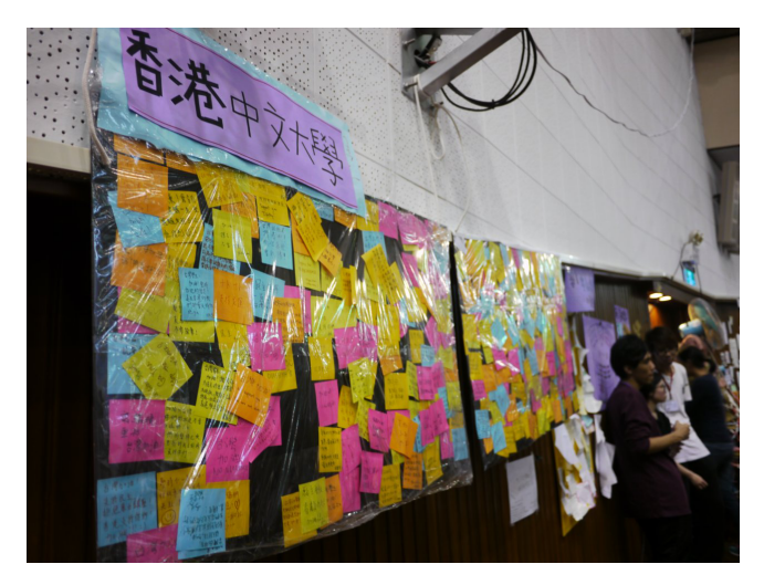
Figure 4. The panel on the wall of the occupied main chamber of the Legislature.