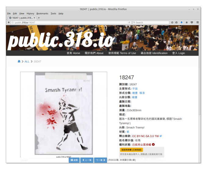
Figure 6. An identified artifact [18247].