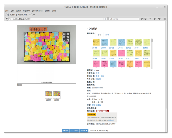
Figure 3. A panel of supporting notes from the Chinese University of Hong Kong [12958].