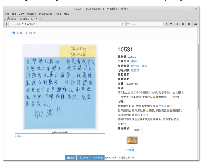
Figure 2. A supporting note from a student at the Department of Social Work, Chinese University of Hong Kong [10531].