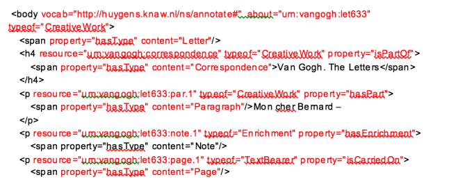
Figure 3. HTML fragments of a letter of Vincent van Gogh (http://vangoghletters.org/orig/let633) described by embedded RDFa. The letter is identified by a URN

Although this approach is focused on annotation of resources on the web, the same principle could be applied in offline annotation, if the offline resources are described in a similar way and annotation clients are developed to make use of this. Also, descriptive information for textual sources can be embedded as markup, but for audiovisual documents, this has to be done via a separate representation, for instance using SMIL (Bulterman et al., 2008).